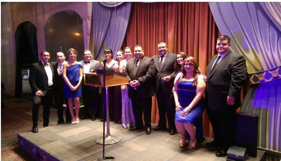
2013-2014 SF-HAAC Executive Council